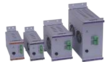
SMPS POWER SUPPLIES